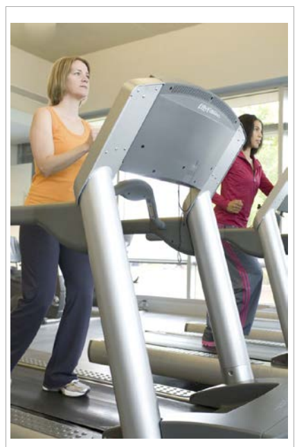
Proper exercise is key in the treatment of osteoporosis.