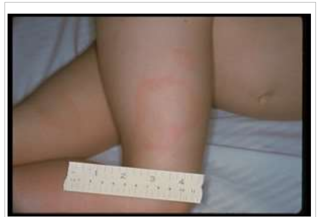
The erythema migrans rash starts as a small red mark. Over the next days, it slowly enlarges to two or more inches wide.

Late-stage infection rarely can also harm the nervous system. It may affect the peripheral nerves (nerves outside the brain and spinal cord), leading to numbness or tingling or, less often, weakness. If the infection affects the brain, it may lead to trouble with memory and concentration.